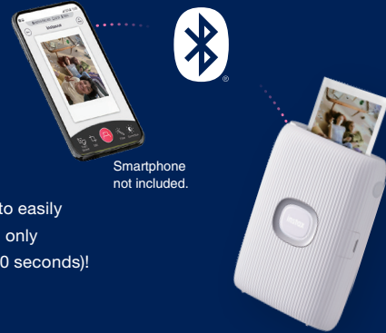
Smartphone not included.

Use the free downloadable INSTAX MINI LINK App to easily print multiple images right from your Smartphone in only 15 seconds (film development time approximately 90 seconds)! You can even print your favorite still from a video!