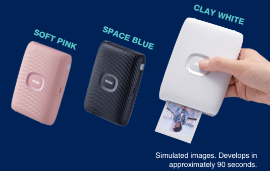
Simulated images. Develops in approximately 90 seconds.