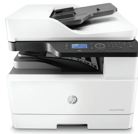
HP LaserJet MFP M436nda

Count on reliable, affordable A3 MFP productivity to expand potential. Simplify workflows with efficient scan solutions and copying, and get networking plus remote monitoring. 1 Save resources and time with automatic paper-handling features. 2,3