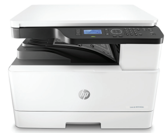
HP LaserJet MFP M436n