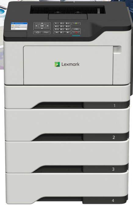
MS521dn with optional trays