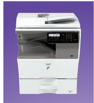
Desk top configuration