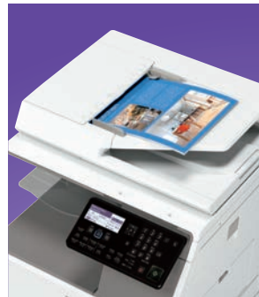
Full colour network scanning