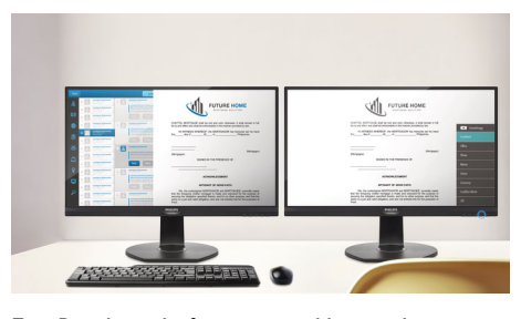
EasyRead mode for a paper-like reading experience